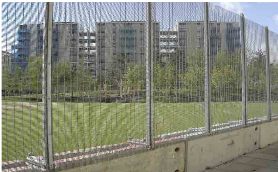
Above: The Intellectual Property Office has granted Zaun a patent for its MultiFence security fence assembly invention.