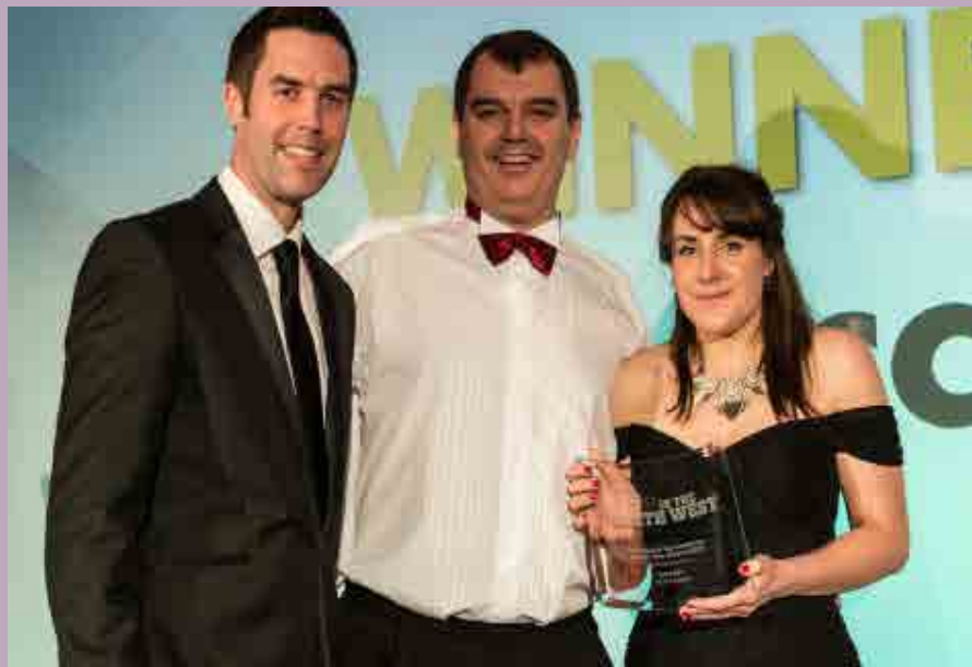
Above: ATG Access beat strong competition to be named the winner

Other large projects have varied hugely in scope from a local project to control traffic flow in and out of the new St Peter's Square development in Manchester to over 80 high security road blockers