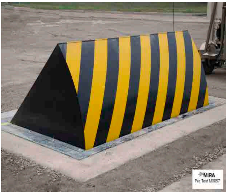
Above: Recently added to Avon Barrier range is the RB1000CR Centurion Road Blocker, tested to the US standard ASTM 2656-07, achieving an M50 P1 rating.