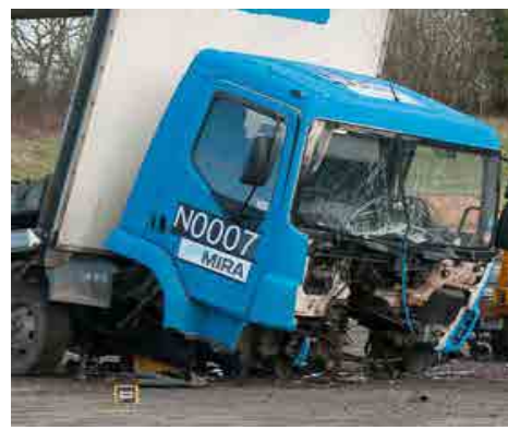
Above: HT1-Matis halted a 7.5 tonne truck during crash testing

Heald is proud to announce a new entry in our ever evolving line of perimeter security products – the shallow mount HT1-Mantis. Evolved from our existing HT1-Raptor range, the Mantis has been designed with a number of unique features to set it apart from the crowd.