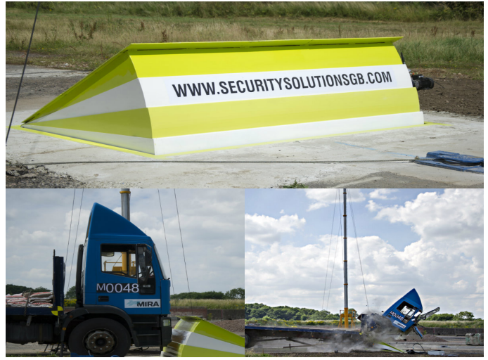
Above: The mighty 'Bison Road Blocker'

Should you want a site survey conducted to see how the Bison Road Blocker could improve your current security arrangements call 0843 290 9250