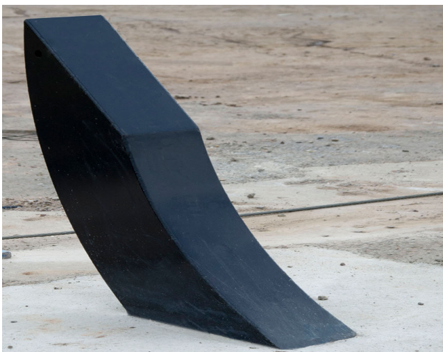
Below: Heald's new Fixed Raptor bollard provides a flexible high security solution which integrates well into any environment

Never a company to rest on its laurels, Heald's latest innovation is the shallow mount Static Raptor bollard, fresh from its recent PAS68 tests where it was proven to stop a 7.5 tonne truck travelling at 48kph with zero penetration and zero dispersion. Orders are already coming in for the Static Raptor, which can be used individually or as part of an array to secure an aperture of virtually unlimited size.