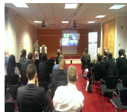
PSSA Members at the AGM Conference

There is now the desire to push on with the PSSA, collect more members and get more products and companies through verification schemes to allow the PSSA to grow in stature.