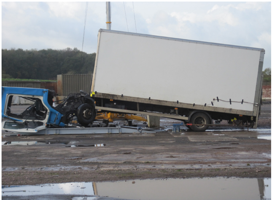
Above: The 'Blockout-Kerb' test

Although the new IWA's may be purchased directly from ISO, members may wish to hang on until BSI supply the documents, which may attract BSI member discount and avoid currency conversion fees. Note also that test houses will need to become accredited to the new IWA's before a full service can be provided.